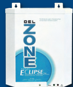
Total Eclipse™ 2 & 4